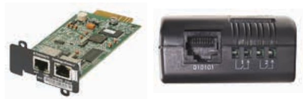
Optional Web/SNMP card with EMP probe for temperature measurement of an external battery cabinet or rack.

the charger uses a constant float voltage. ‘ABM enabled’ is the default setting. The charger voltage levels are (by default setting) programmed to be dependent on an internal temperature sensor measurement, thus providing further enhancement to battery health. The external batteries can be also provided with temperature dependent charger voltage. For this purpose a Web/SNMP card with Environmental Monitoring Probe (EMP) is required.