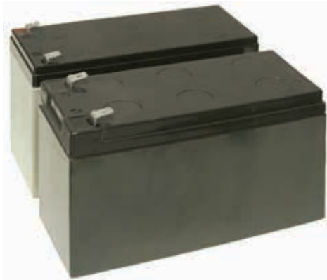
ABM technology significantly increases battery service life.